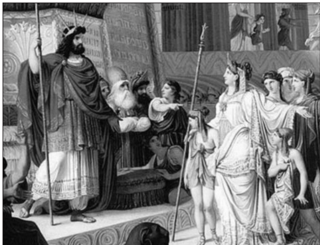
The Queen of Sheba visits Solomon

Josephus, the Queen of Sheba brought “the root of the balsam” as a present to King Solomon (Antiquities 8.6.6). This can beautifully show that the healing balm of God’s word was first brought to the nation of Israel. “He showeth his word unto Jacob, His statutes and his ordinances unto Israel. He hath not dealt so with any nation; And as for his ordinances, they have not known them. Praise ye Jehovah” (Psalms 147:19-20 ASV). What a unique privilege that this beloved nation of Jehovah had, His words were even brought to them by the Son of God, but again as so often down through their history, they neglected the word of God, even rejecting the Messiah sent to the lost sheep.