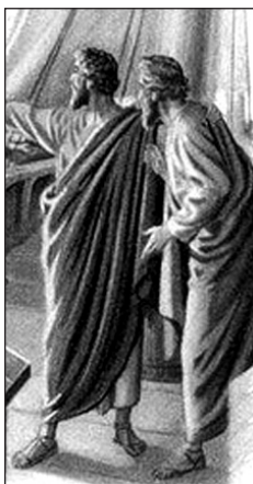
Paul, on ship

Paul states in the next two verses the need for rightly dividing the truth and the need for care in teaching the Gospel of Christ. “For a time is coming when they will not tolerate wholesome instruction, but, wanting to have their ears tickled, they will find a multitude of teachers to satisfy their own fancies; and will turn away from listening to the truth and will turn aside to fables” (2 Timothy 4:3-4 WNT).