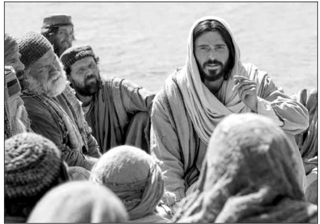
We should be followers of our Master, Jesus.

The question remains on the day of at-one-ment, did the Jews understand the big picture of what was involved? Did they know that one day in the distant future the sins of the obedient toward God would not only be covered, but removed completely? It appears to be that they only knew that their sins were being covered for the year ahead of them. So then, the basis of the atonement was the sacrifice of sin-a