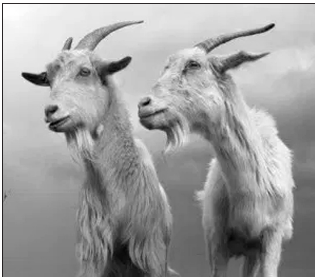
Two goats presented for the Day of Atonement

Just as these goats were taken from the people , as it were, to be representatives of them, so the church has been taken “from among men.” In Acts 15:14 we read “Simon has declared how God at the first visited the Gentiles to take out of them a people for his name” (MKJ). This honour went first to the Jews but when that nation proved unworthy of this “honour” it was offered to the Gentiles.