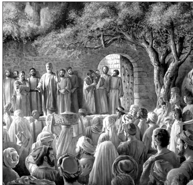
The Day of Pentecost

This fulfilment of Joel’s prophecy related to the development of the firstfruits class during the Gospel Age. As of yet, Peter’s hearers knew nothing about the operation of the Holy Spirit as it was to affect the lives of the footstep followers of Jesus. The