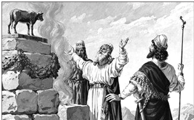
The sin of Jeroboam

the people of the land take one man from among them and make him their watchman and he sees the sword coming upon the land, and he blows on the trumpet and warns the people, then he who hears the sound of the trumpet, but did not take warning; his blood will be on himself. But had he taken the warning; he would have delivered his life. But if the watchman sees the sword coming and does not blow the trumpet, and the people are not warned, and a sword comes and takes a person from them, he is taken away in his iniquity; but his blood will I require from the watchman's hand. Now as for you, son of man, I have appointed you a watchman for the house of Israel; so you will hear a message from My mouth, and give them a warning from Me. When I say to the wicked, O wicked man, you shall surely die, and you do not speak to warn the wicked of his way, that wicked man shall die in his iniquity, but his blood I will require from your hand. But you on your part warn a wicked man to turn from his way, and he does not turn from his way, he will die in his iniquity; but you have delivered your life."