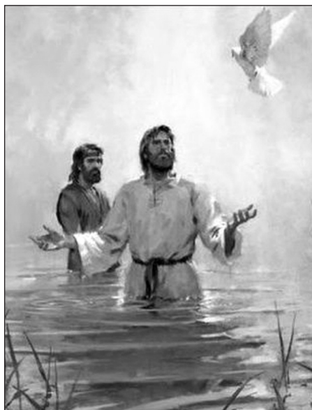
Baptized with the Holy Spirit

It also makes possible our knowledge of the privilege and responsibilities of sonship. The Apostle Paul stated, “Now we have received, not the spirit of the world, but the Spirit which is of God; that we might know the things that are freely given to us of God” (1 Corinthians 2:12). It is a knowledge of these things that enables us to walk more fully in the footsteps of Jesus.